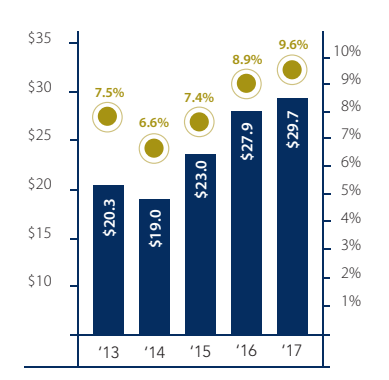
CAPITAL EMPLOYED AND RETURN ON CAPITAL<sup>(1)</sup> FISCAL YEARS 2013-17 (IN MILLIONS)

PRE-TAX INCOME AND PRE-TAXMARGIN (excluding restructuring) FISCAL YEARS 2013-17 (in millions)