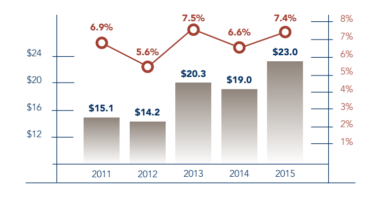
PRE-TAX INCOME AND PRE-TAX MARGIN (EXCLUDING RESTRUCTURING) FISCAL YEARS 2011-15 (IN MILLIONS)