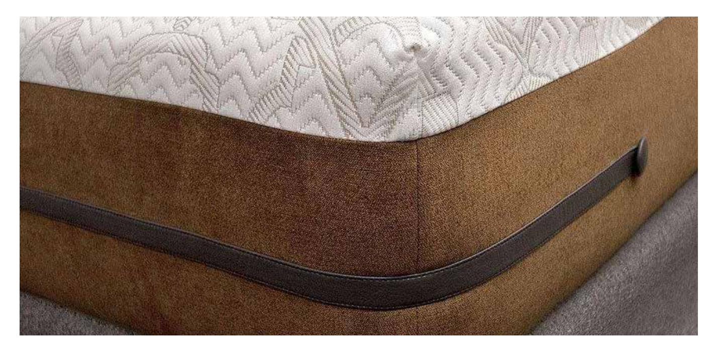
OUR FOCUS ON DESIGN AND INNOVATION SETS US APART IN THE MATTRESS FABRIC MARKETPLACE.