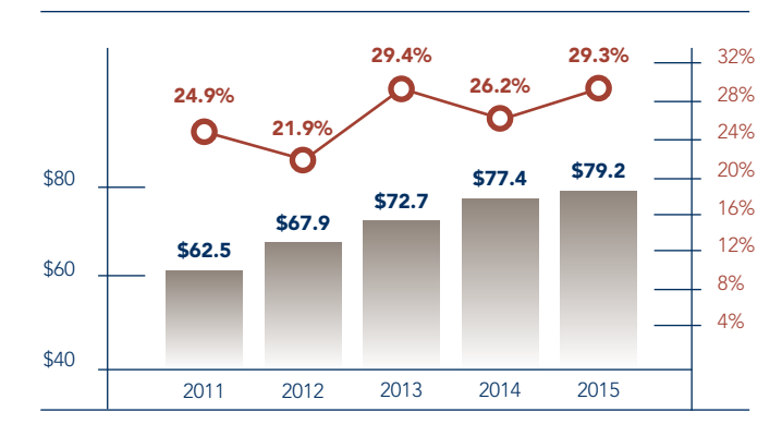
CAPITAL EMPLOYED AND RETURN ON CAPITAL FISCAL YEARS 2011-15 (IN MILLIONS)